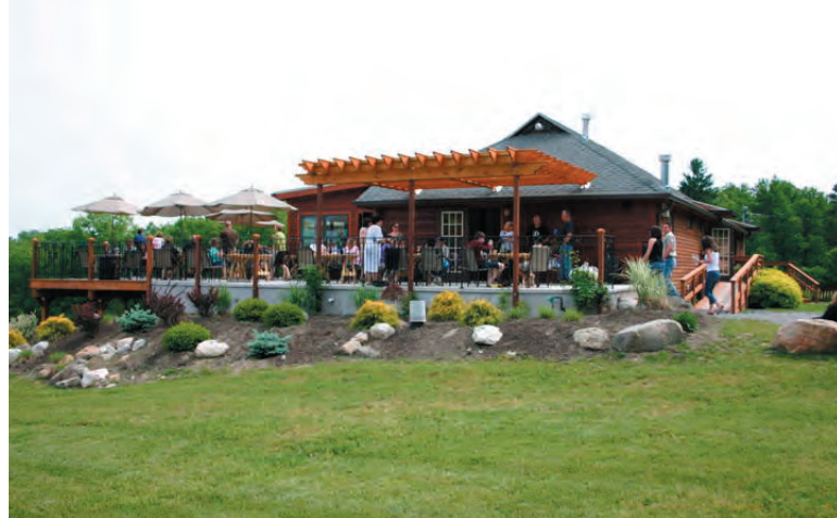
The newly renovated deck at Robibero Family Vineyards