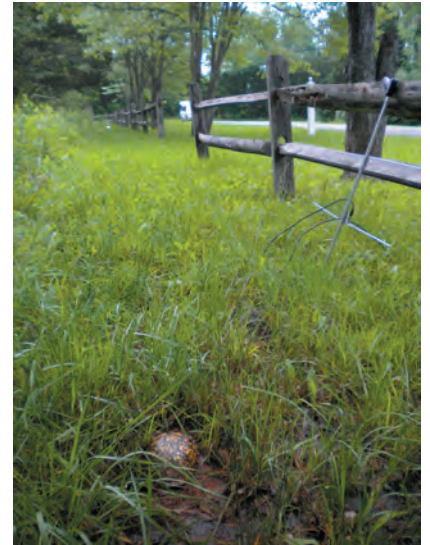
"Alpha" in the tall grass at River Park.

2005, in the rear of our field on May 4. She had traveled 2/3 miles! Apparently she has since laid her eggs near a mailbox there. All that remains is the hole and some dried up eggshells, but the transmitter tells us that Alpha is still in the area. My trained tracking dogs and I have been tracking her on River Park Drive since hearing from the DEC. Where will she go next? We have asked some of the residents of River Park and Emmy Lane to be on the lookout since the